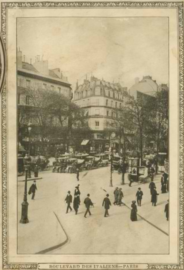
BOULEVARD DES ITALIENS—PARIS