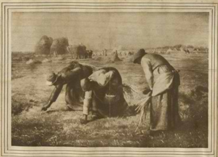
THE GLEANERS. BY MILLET (THE LOUVRE)