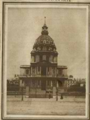
THE TOMB OF NAPOLEON. PARIS