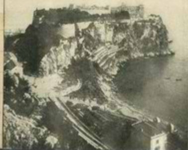
CITY OF MONACO